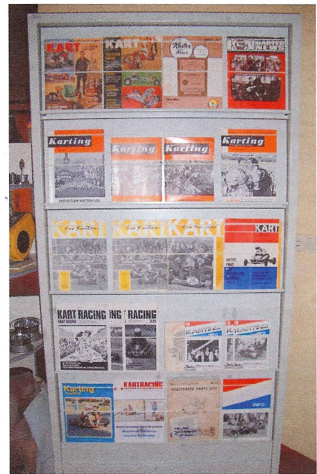
Various karting publications were on display along with other memorabilia.