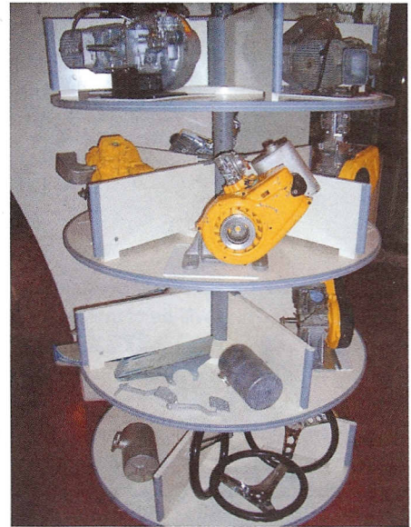
Early American engines and parts