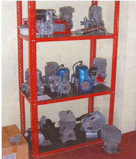
European specialist kart engines, which were a later development than the repurposed US engines