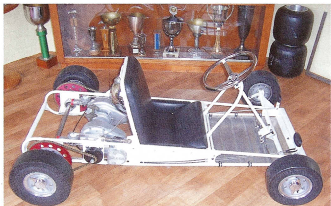
A US-built Moss kart from 1960. It looks totally different to our modern karts, but the tyres possibly look a bit more familiar